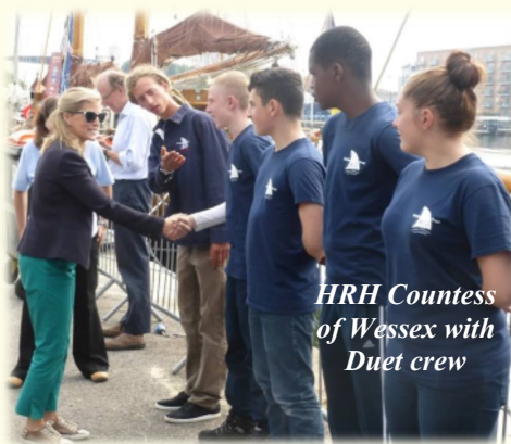
HRH Countess of Wessex with Duet crew

Following the race, Duet and Queen Galadriel, sailed to Royal Greenwich for a maritime festival and the prize giving which took place on the lawn of the Queen's House, close to the National Maritime Museum. HRH the Countess of Wessex attended the event and Duet's crew were among sailors and young trainees to be introduced to the royal visitor. The whole experience was one they will never forget.