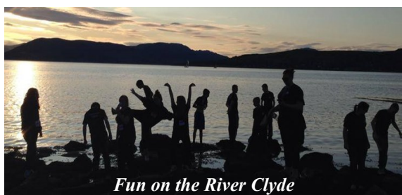
Fun on the River Clyde

Membership Scheme — Anyone can apply for membership of our scheme to become an official Cirdan supporter. Members pay just £20 a year plus any additional contribution they may wish to give. All the proceeds from the scheme help to further our work with disadvantaged young people. In return, apart from our gratitude, members will receive our Newsletters, advance notice of any special adult voyages and the opportunity to help out with the occasional delivery voyage. For more information please contact us.